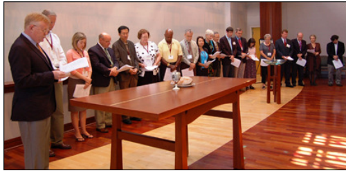
Commissioning of the Presbyterian Hymnal Committee September 23, 2008 at Presbyterian Center Chapel in Louisville, KY

The 2004 General Assembly of the Presbyterian Church (U.S.A) authorized the Presbyterian Publishing Corporation, the Presbyterian Association of Musicians, and the Office of Theology and Worship to begin research into the feasibility of a new Presbyterian hymnal. With the help of Research Services of the PC(USA), a questionnaire was developed and distributed to a nationally representative group of members, elders, and ordained ministers. The results of this research were presented to the 2006 General Assembly, which granted authorization for the Presbyterian Publishing Corporation to research, develop, and produce a new hymnal. The Presbyterian Publishing Corporation is assuming all costs for the development and production of the hymnal, including the expenses of the Hymnal Committee.